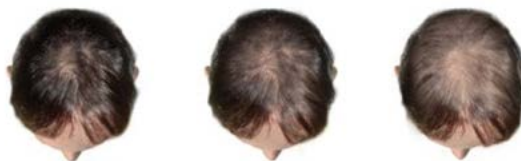
FEMALE-PATTERN HAIR LOSS

The most common cause of hair loss and thinning in both men and women is hereditary, also referred to as male and female pattern baldness. As seen in the below diagram, female pattern hair loss typically occurs along the part, whereas for men, thinning generally occurs on the crown or as a receding hairline.