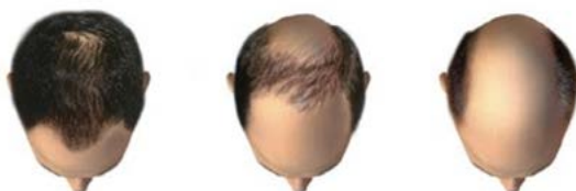
MALE-PATTERN HAIR LOSS